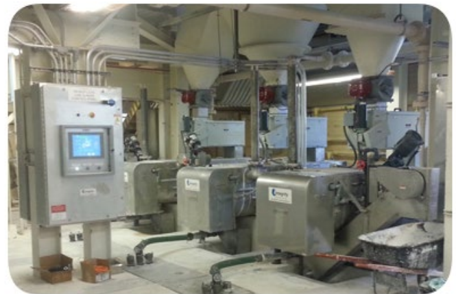
Davis WTP, Austin TX