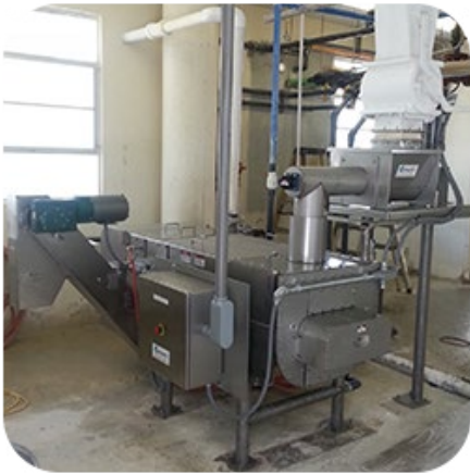
Fort Pierce Utilities Authority, FL