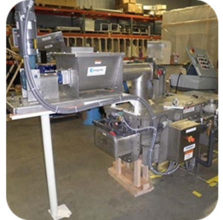
Nebraska City WTP, NE