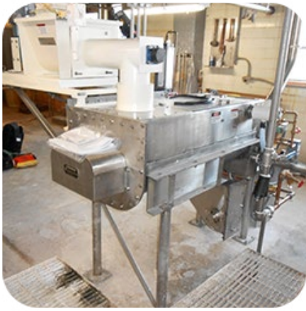
Campbell's Soup Manufacturing Plant, Napoleon OH