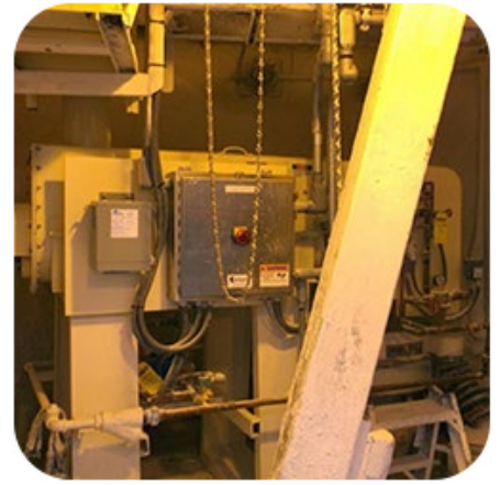
Covanta Energy, Onodaga, NY