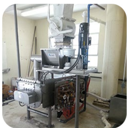
Fort Pierce Utilities Authority, FL