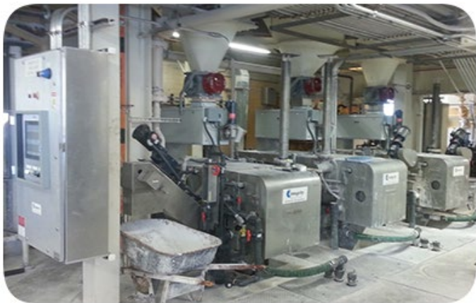
Davis WTP, Austin TX