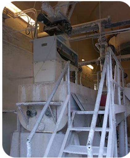
Miami Dade WTP 31-165 Feeder Replacement