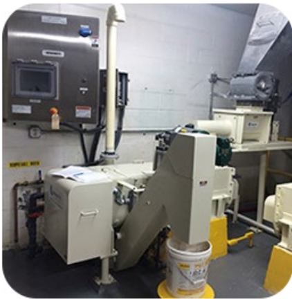
Nebraska City WWTP, NE