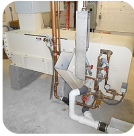
Public Water Supply District #2, Defiance MO